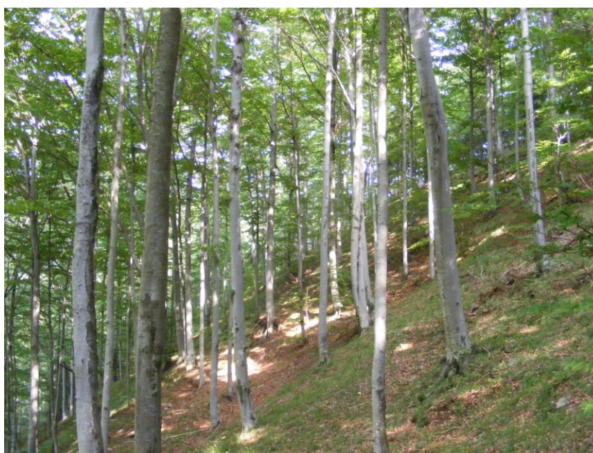
Fig. 1. Asperulo-Fagetum beech forest on Valea Neagră (Siriu Mountains)

Monitoring: Monitoring the conservation status of habitat, the specific composition and its evolution. Monitoring of pest populations, observance of phytosanitary requirements, protect the populations used in biological control.