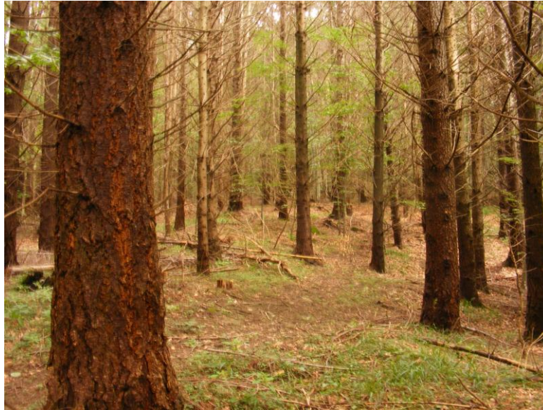
Fig. 4. Acidophilous Picea forest on Plaiul Mreaja (Siriu Mountains)

of ATVs, etc). Promoting of a conservative management (natural regeneration), avoiding the chemical treatments and clearcuttings.