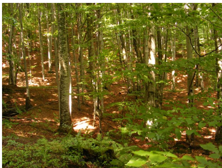
Fig. 2. Dacian Beech forests ( Symphyto-Fagion ) on Valea Neagră (Siriu Mountains)

Monitoring: Monitoring of conservation status of the habitat, of the specific vegetal composition and the effects of the applied sylvocultural measures, in order to identify the interventions with low impact on biodiversity.