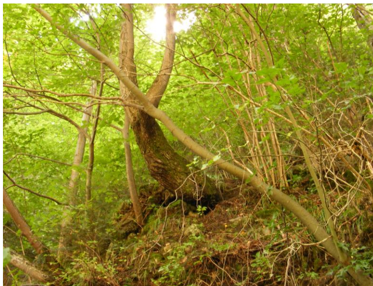
Fig. 5. Tilio-Acerion forest in Buzău Quays (Siriu Mountains)

Flora composition: Edifying species: Corylus avellana , Spiraea chamaedryfolia , Poa nemoralis . These coenoses installed on rocky slopes explain the presence of the saxicolous species: Campanula carpatica , Asplenium trichomanes , Saxifraga cuneifolia , Festuca rupicola ssp. saxatilis . Other important species: Scopolia carniolica , Rosa pendulina , Cardamine impatiens , Dryopteris filix-mas , Veronica urticifolia , Gentiana asclepiadea , Asplenium scolopendrium .